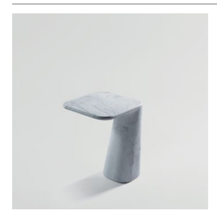
At 720mm and 500mm in height, Hurlysi High (left) and Hurlysi Low (above) are carved out of a single piece of Elba stone.