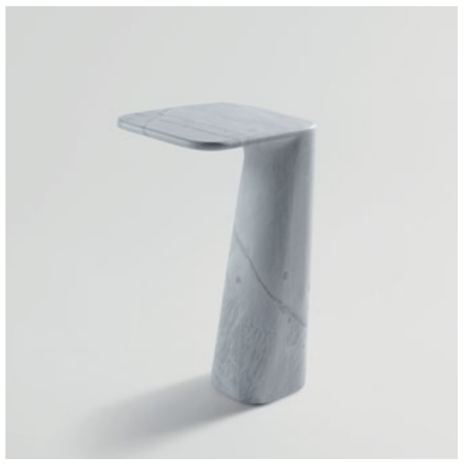
A solid piece of Elba is carved to create a cantilevered resting surface for objects. This is stone at its purest: simple, distinctive and statuesque. Cut to heights of 500mm or 720mm, each side table is available individually or as a complementary pair.