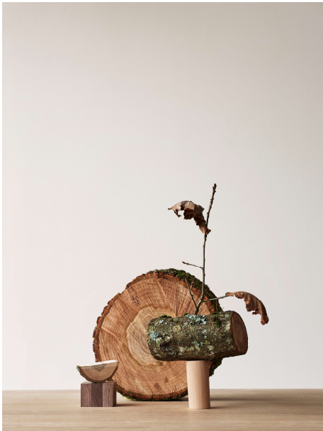
CARL HANSEN & SØN 2020