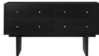
Private Sideboard H90 x W160 x D45 cm