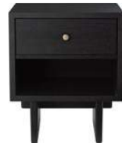
Private Side Table H60 x W50 x D40 cm