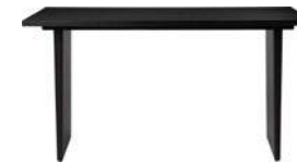
Private Desk H74 x W120 x D60 cm