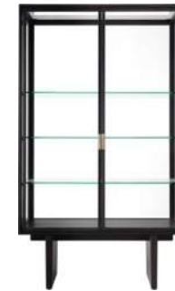
Private Vitrine H191 x W110 x D45 cm