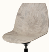
Wood Waste Grey

The Eternity Swivel chair aligns with the rest of the Eternity Collection with a soft-shaped shell made of our waste material Matek®. The waste materials used for the Matek® come from post-consumer e-waste mixed with either wood or coffee waste, depending on the colour. The base frame is made of 96% recycled, black-painted aluminum. The Eternity Swivel Chair comes in several Matek® blends and with or without upholstery.