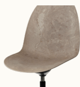
Coffee Waste Light