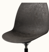
Coffee Waste Black