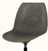
Coffee Waste Dark