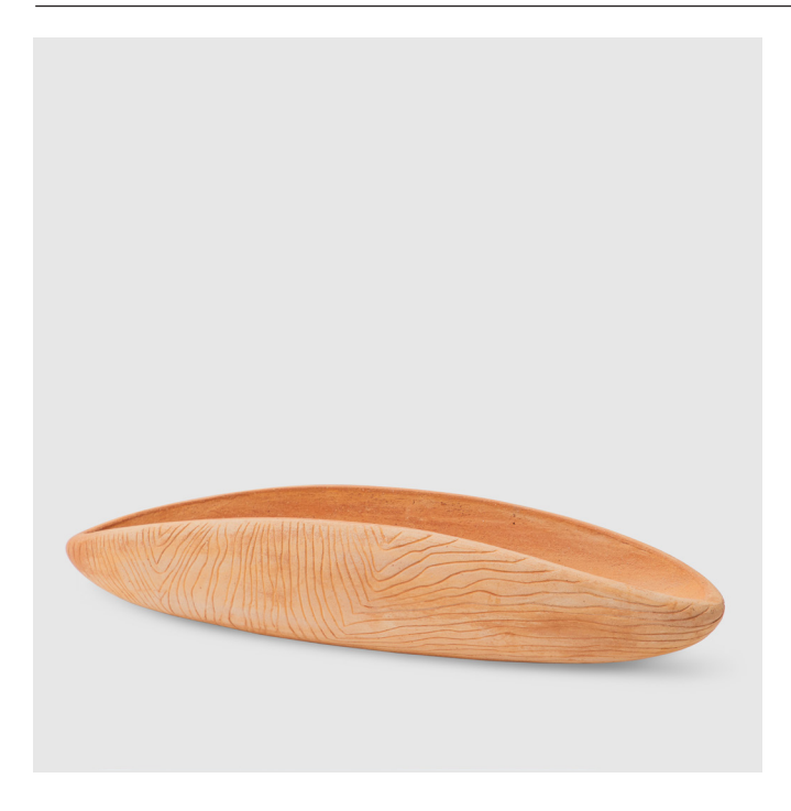
Earth Wirri takes its inspiration from bark coolamons, water carriers and other expertly crafted tools and utensils born of country over generations.