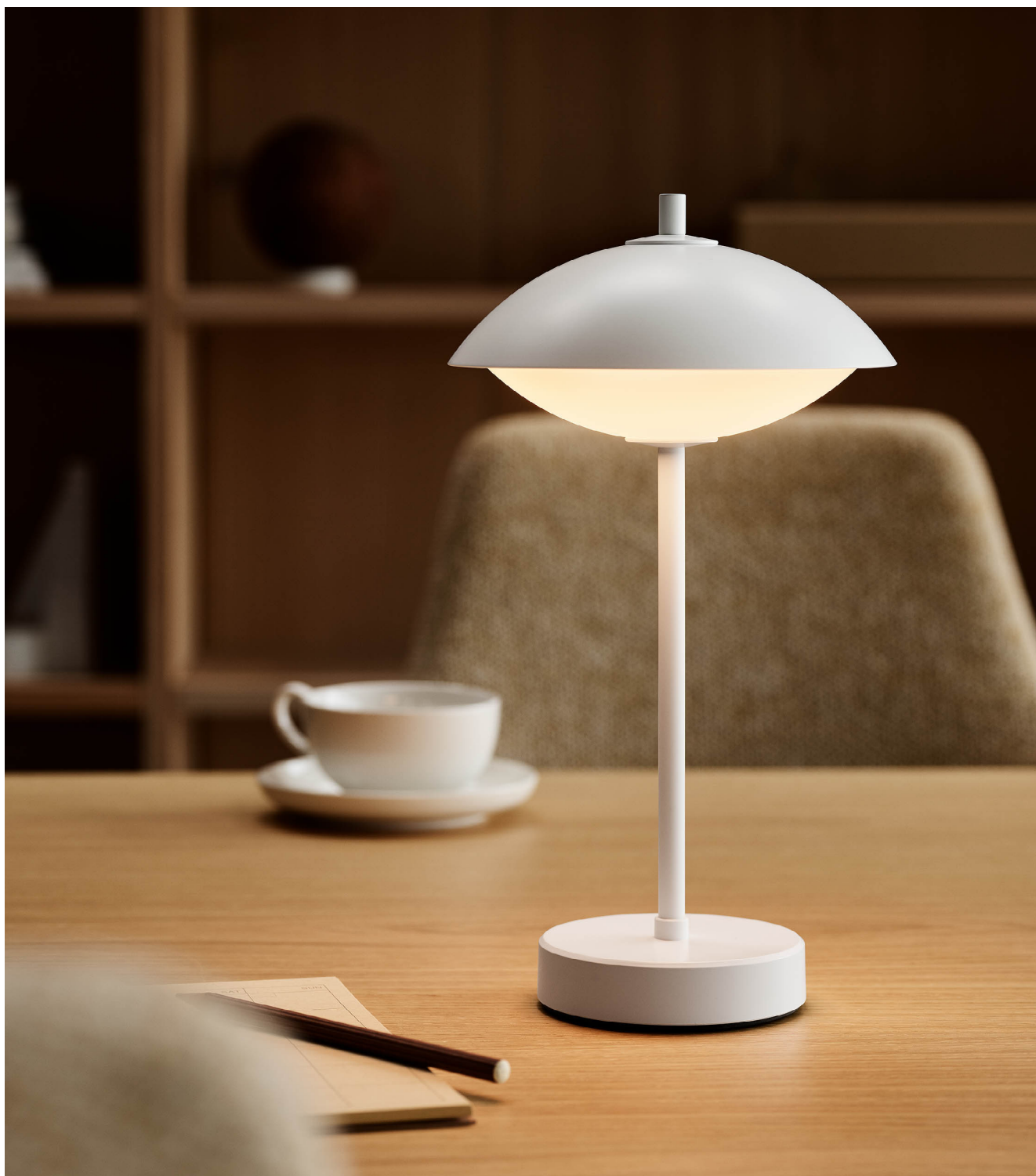
CLAM™ PORTABLE PRODUCT FACT SHEET